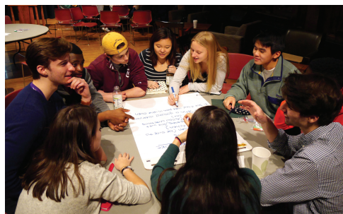
D-LAB's small-group discussion format facilitates conversations about values and leadership.

The Rockefeller Center is dedicated to developing the leadership potential of Dartmouth undergraduates. Leadership is based on action, not position – it is the ability to mobilize a group and its resources toward a common goal. It requires the growth of our students' talent, vision, and entrepreneurial spirit. The liberal arts education at Dartmouth is the cornerstone, but not the extent, of leadership