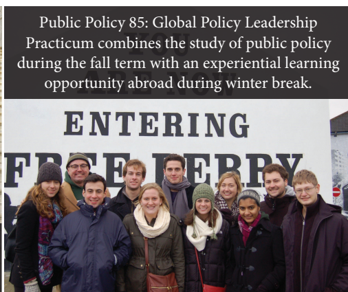
Public Policy 85: Global Policy Leadership Practicum combines the study of public policy during the fall term with an experiential learning opportunity abroad during winter break.