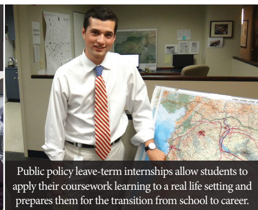
Public policy leave-term internships allow students to apply their coursework learning to a real life setting and prepares them for the transition from school to career.