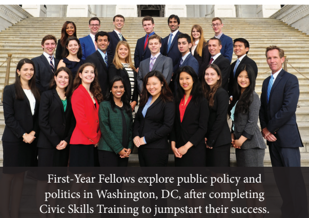
First-Year Fellows explore public policy and politics in Washington, DC, after completing Civic Skills Training to jumpstart their success.

YOU can have an impact on the next generation of public policy leaders!