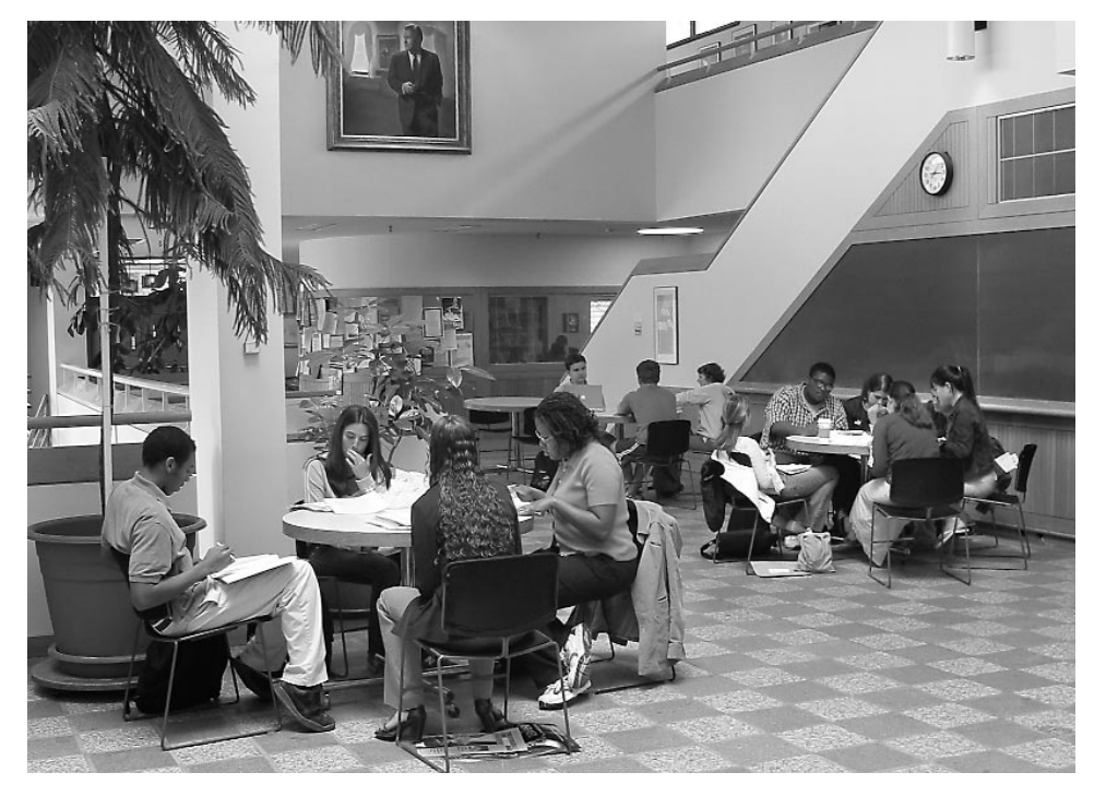
More than 280 students attended AGORA discussions at the Center throughout the year.

One avenue to achieve the latter goal is through the McSpadden Public Issues Forum fund. MPIF provided financial support to a number of other student organizations to bring 12 public affairs programs to campus. They included: "Two Concepts of Secularism" (Voces Clamantium, DEN, Tucker Foundation); "The M Word: The Future of Same Sex Marriage" (Sigma Delta Sorority); "AIDS in America" (Student Global AIDS Coalition); "Civil Rights in a National Crisis" (The Pan Asian Council); "First Annual All-Ivy Native American Student Conference" (Native Americans at Dartmouth College); "Hip-Hop Identities and Poetic Race Relations" (Afro-American Society); and "Death Penalty Symposium" (Dartmouth College Greens).