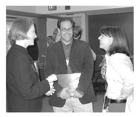
New faculty gather at the Rockefeller Center