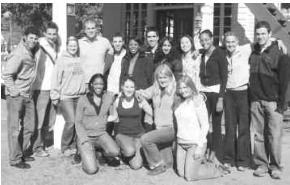
LEFT Rockefeller Leadership Fellows gathered at their fall term retreat at the Alden Inn in Lyme, NH.