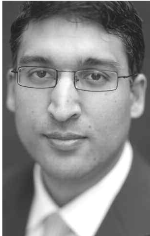
Neal K. Katyal '91

Professor Katyal, who teaches law at Georgetown University Law Center, took a personal as well as professional interest in the case. His parents emigrated from India to the United States because of this country's roots in equality and law, he said. He told the audience the Fourteenth Amendment to the Constitution provides for equal protection of the law to all persons, not just citizens, noting that "when we punish people, we have to treat aliens the same way we treat citizens... We fought a war so that all people could have constitutional rights."