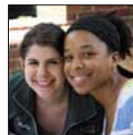
JUNE 2012 Center says congratulations to Class of 2012 at Senior BBQ