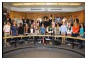
MAY 2012 More than 350 students have now participated in our Management & Leadership Development Program