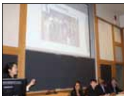
MAY 2012 RLF gives presentation at Alumni Council meeting