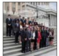
JUNE 2012 Students in the Class of 2015 attend CST in Washington, DC