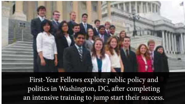
First-Year Fellows explore public policy and politics in Washington, DC, after completing an intensive training to jump start their success.

YOU can have an impact on the next generation of public policy leaders!