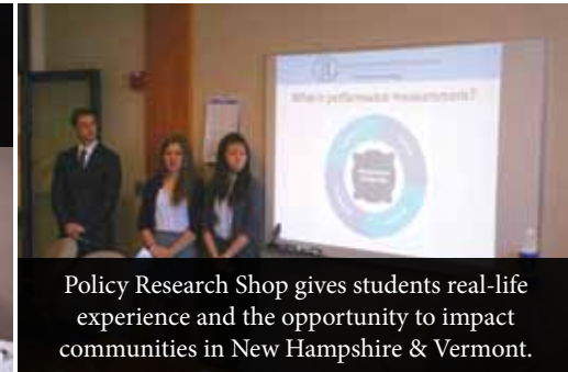
Policy Research Shop gives students real-life experience and the opportunity to impact communities in New Hampshire & Vermont.