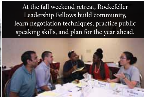
At the fall weekend retreat, Rockefeller Leadership Fellows build community, learn negotiation techniques, practice public speaking skills, and plan for the year ahead.