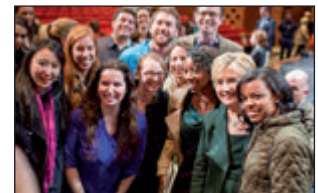
NOV. 2015 Presidential candidate Secretary Hillary Clinton speaks to more than a thousand Dartmouth students and community residents as the third speaker featured in the America's Economic Future series, co-sponsored by the Tuck School and the Rockefeller Center.