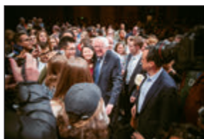
JAN. 2016 Presidential candidate, Sen. Bernie Sanders, leads a town hall discussion at Dartmouth in an event hosted by the Rockefeller Center and the Tuck School.