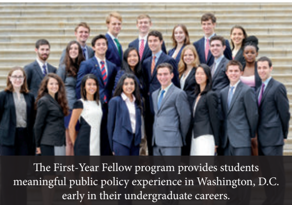
The First-Year Fellow program provides students meaningful public policy experience in Washington, D.C. early in their undergraduate careers.

The Nelson A. Rockefeller Center delivers innovative programs that engage students in scholarship and leadership. It is only through the generosity of past, present, and future donors that the Center can pursue this mission and to achieve it with such positive impact.