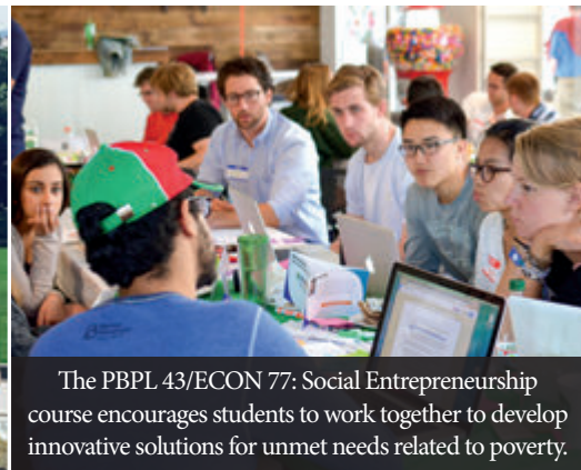
The PBPL 43/ECON 77: Social Entrepreneurship course encourages students to work together to develop innovative solutions for unmet needs related to poverty.