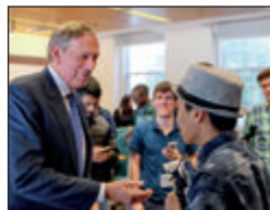
OCT. 2015 Presidential candidate New York Gov. George Pataki participates in the "America's Economic Future" lecture series, co-sponsored by the Tuck School and the Rockefeller Center.