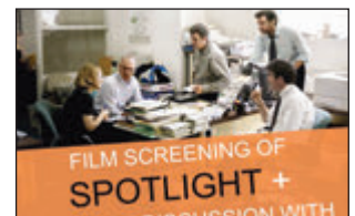
JUNE 2016 The Rockefeller Center and the Tucker Center co-sponsor a screening of the film Spotlight and panel discussion with Boston Globe journalists.