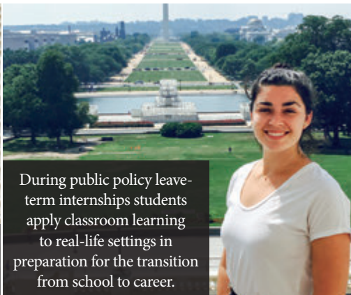
During public policy leave-term internships students apply classroom learning to real-life settings in preparation for the transition from school to career.