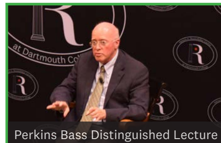
Perkins Bass Distinguished Lecture

Free Political Speech Under Threat: Eisenhower Would be Ashamed Laurence Silberman '57