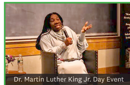
A Student Conversation with MLK Keynote Speaker Tarana Burke Tarana Burke