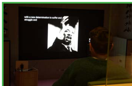
MLK Jr.'s Speech to Dartmouth College