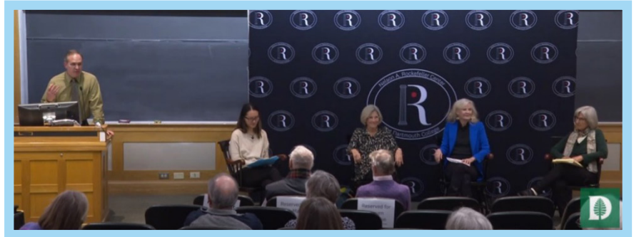
50 Years of Coeducation at Dartmouth: Student and Faculty Perspectives, November 2022