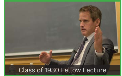
Empowering the Reasonable Majority Former U.S. Congressman Adam Kinzinger