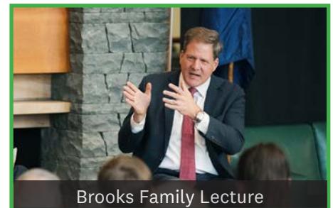
Brooks Family Lecture