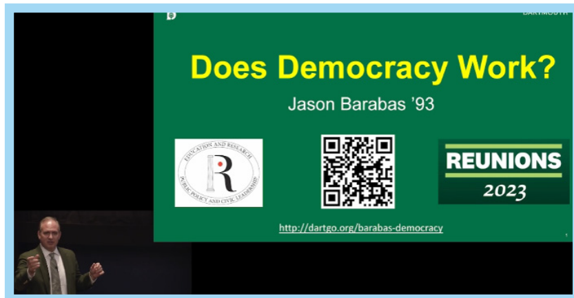
A “Back-to-Class” Lecture during Alumni Reunions, June 16th, 2023