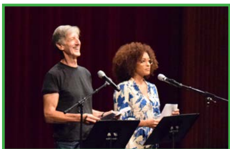
An Evening with Andy Borowitz Andy Borowitz