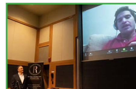
Implications of the 2022 Midterms on the 2024 Election Cycle Harry Enten '11